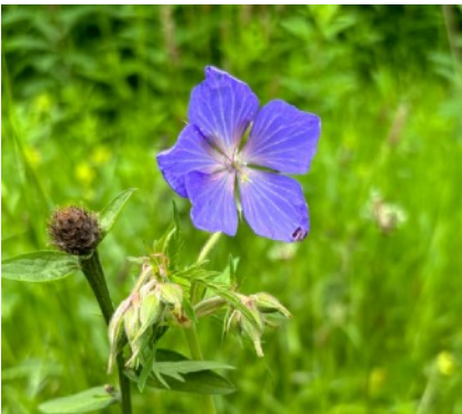
Meadow crane's bill