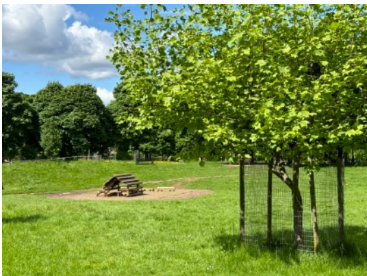
View over to log house with tulip tree

There has been an abundance of wildflowers growing where mowers would normally have cut by now. We hope that in future mowing will be limited to central areas. So far we have not been able to agree a mowing plan despite a big effort by David Kyles to persuade mowers to plan for future cuts.