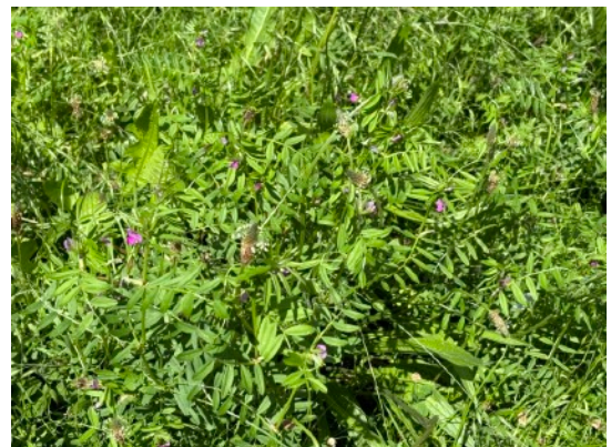
Vetch growing wild amongst grass