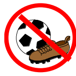
On reserved sites & pitches

Park Watch Partners: ... Every 'Friend' is a partner in helping to protect our unique urban parkland, by acting as the Council's eyes and ears. They will appreciate your assistance, as they cannot be everywhere at all times. Just telephone one of the numbers below, if you see something that needs their attention, (you may give your name or not— as you prefer).