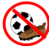
On reserved sites & pitches

Park Watch Partners: ... Every 'Friend' is a partner in helping to protect our unique urban parkland, by acting as the Council's eyes and ears. They will appreciate your assistance, as they cannot be everywhere at all times. Just telephone one of the numbers below, if you see something that needs their attention, (you may give your name or not— as you prefer).