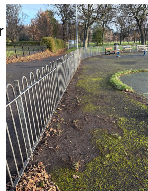
LINKS PLAYGROUND after