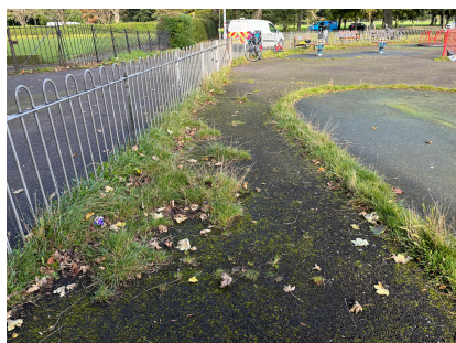
LINKS PLAYGROUND before