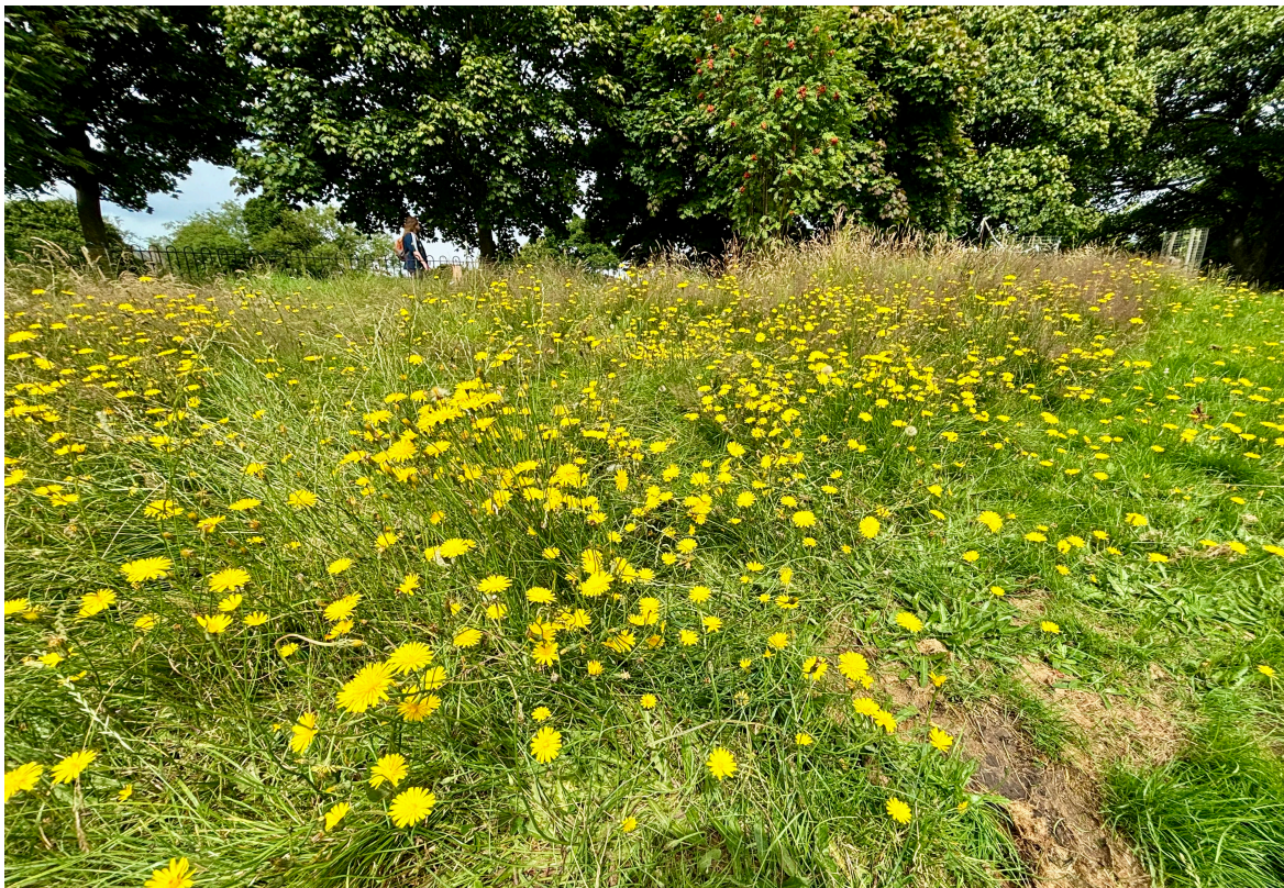
Unmown grass at the Links with cat's ear.

There has been an abundance of wildflowers growing where mowers would normally have cut in the summer. We hope that in future mowing will be more limited to central areas, although grass still should be cut at the correct time. So far we have not been able to agree a detailed mowing plan, despite a big effort by David Kyles to persuade mowers to plan for future cuts. It is hoped further discussions can be held with mowing managers and park staff. There are still examples of mowers cutting down planted hedges etc.