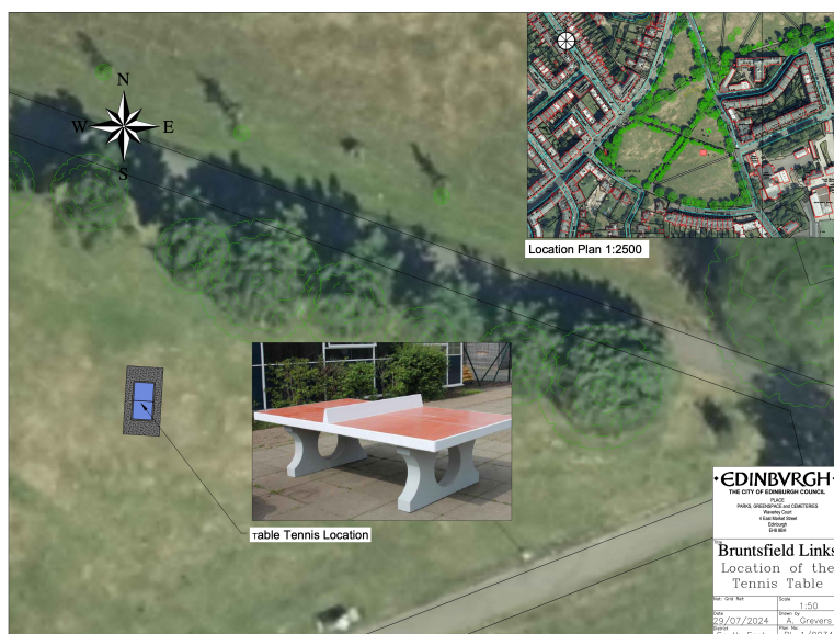
Location for proposed table-tennis table

A CEC community grant was applied for to install a new table tennis table near to existing exercise units adjacent to Eric Liddell Way. This proposal has been welcomed by the community, especially after the success of the table installed near the East Meadows playground. Donations have been given by the Black Ivy Hotel and the JR Group. Unfortunately the grant panel did not select our application. FoMBL will try again next year.