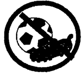
On reserved sites & pitches

P ark Watch Partners: ... Every 'Friend' is a partner in helping to protect our unique urban parkland, by acting as the Council's eyes and ears. They will appreciate your assistance, as they cannot be everywhere at all times. Just telephone one of the numbers below, if you see something that needs their attention, (you may give your name or not— as you prefer).