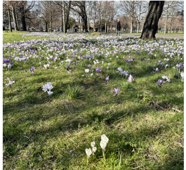
Aconites and crocuses - early signs of spring in the Meadows